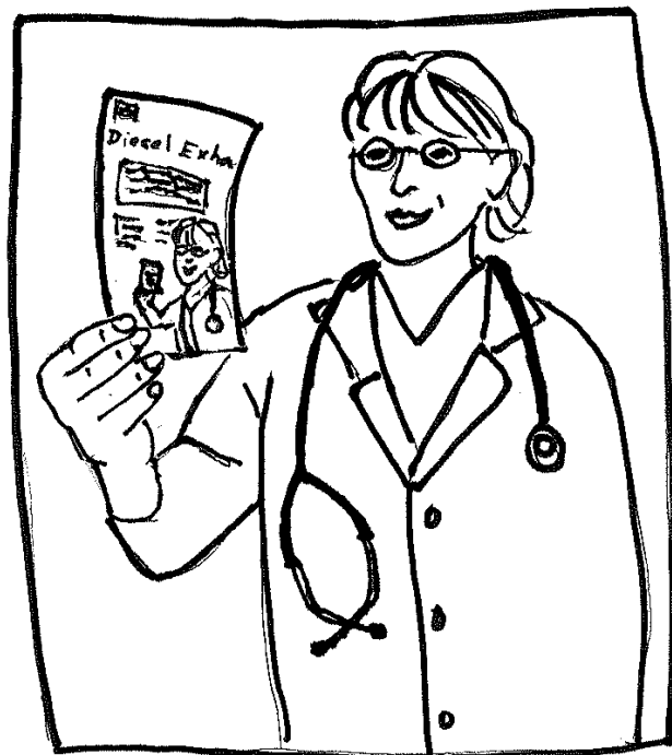
Bring this fact sheet to your doctor.

Treatment for sudden high exposures to DE includes immediate removal from exposure. Oxygen (which may include hyperbaric oxygen therapy if significant CO poisoning is confirmed) or other treatment may be necessary, depending on what is found during your exam.